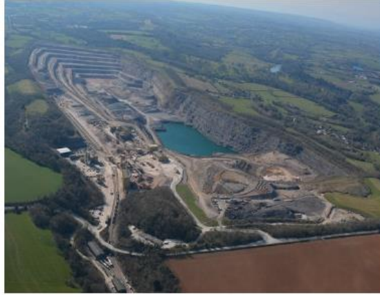
Whatley Quarry, Weymouth

Sibelco have stated they would start quarrying in the South West corner of SIL O2 right next to the Warren. As this first quarry fills with water it will start to look like the Bawsey water pits. Attracting the groups who caused the antisocial behaviour at Bawsey (raves, fights, drugs, drinking, litter) to come to 'our' water pit'. How will they get here and where will they park? The obvious answer is to come through Shouldham and park in the south east side of the Warren, just a hop, skip and a jump away from where the water pit would be. So the Warren and Shouldham would become the new Bawsey for decades.