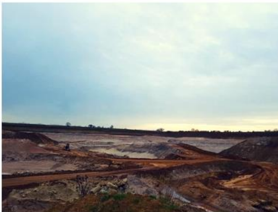
Quarry Leziate

The Warren is removed from AOS E and 'protected' by a 250 m buffer zone around it. 'Hurrah' we all cry! But wait a minute - what if then the area surrounding the Warren is allowed to become a quarry with wet dredging? The Warren now becomes an island in the middle of a quarry. We cannot let this become a reality.