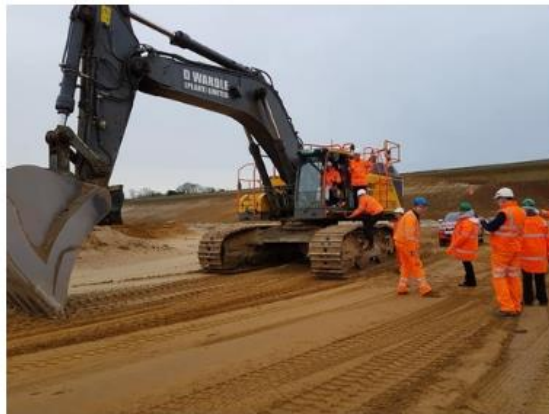
Quarry, Leziate

What if Sibelco don't get the landowners on board to be able to lay a pipeline to pump the slurry between the quarry and Leziate (their preferred option)? What could they do? How would they transport the sand? Build a 'temporary' processing plant on site, as they plan to do at Rudheath in Cheshire (also wet dredged). The only way to move the sand is by HGV. The estimated number of HGV movements per day would be 400+ to move that amount of sand to Leziate. Let that sink in - 400+ HGVs every working day for 20 plus years through Narborough / Fincham.